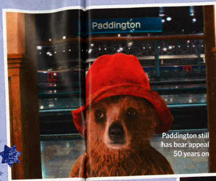
Paddington still has bear appeal 50 years on