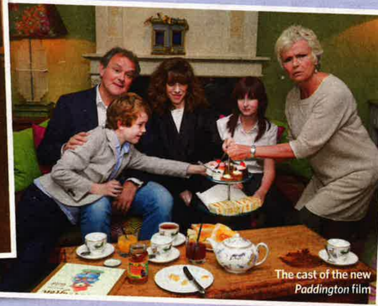
The cast of the new Paddington film

success, there are another 150 books left to film. 'Gosh, I'll be in work until I'm 130,' she shrieks. 'I'll be far too tired to do it then!'